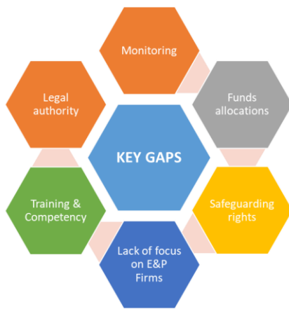
Figure 2. Key Gaps in Policy Framework